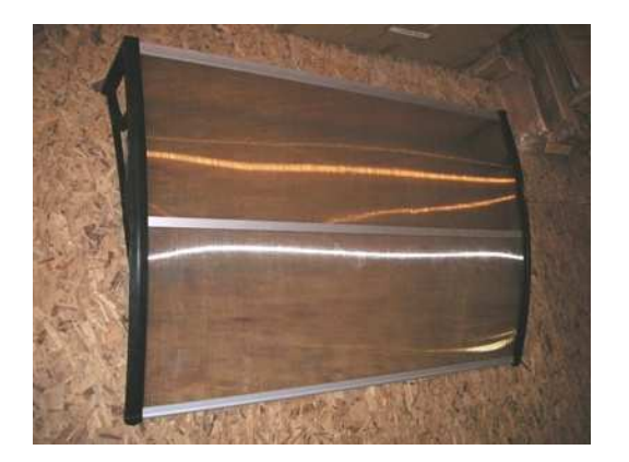
Screw the 6 small screws through the holes in both brackets into the 3 aluminum bars.